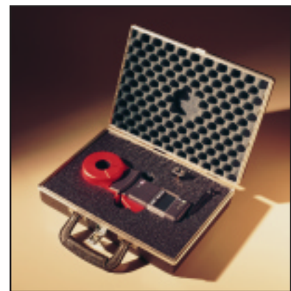
Carrying Case (included)