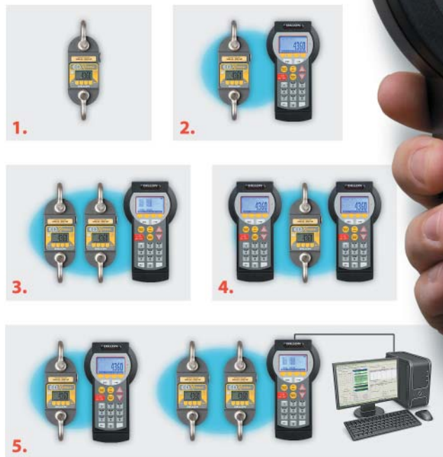
Optional Remote Communicator II