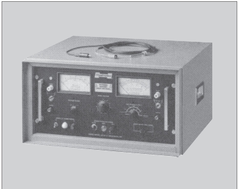
Model H306B Hipot Tester