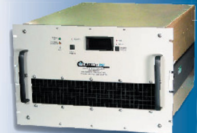
1700-2120 MHz 300 Watts

Series AR amplifiers are rack-mountable units which incorporate the Series AM amplifier in a cabinet containing a built-in universal AC power supply (for models up to 100 watts). Models are available for operation at frequencies from 800 to 3000 MHz and power from 10 to 300 watts. They are forced-air cooled by blowers built into the mechanical package. AR models are also available with an optional IEEE BUS for remote control and monitoring (ARD version).