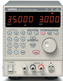
XDL 35-5 Single Output