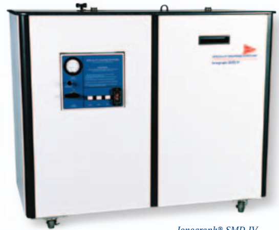
Ionograph® SMD IV

SCS Ionograph SMD II and IV are floor units commonly used for larger circuit boards in high-volume production environments. Submerged agitation jets and heated extract solution provide outstanding sensitivity, operation efficiency and the ability to test ultra-fine pitch components with ease and accuracy.