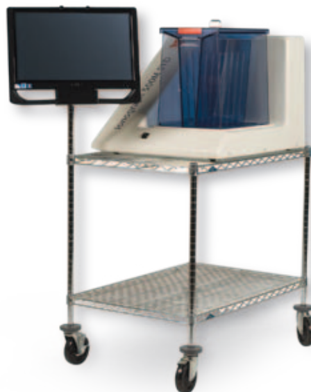
Ionograph® 500M STD with optional cart and all-in-one computer