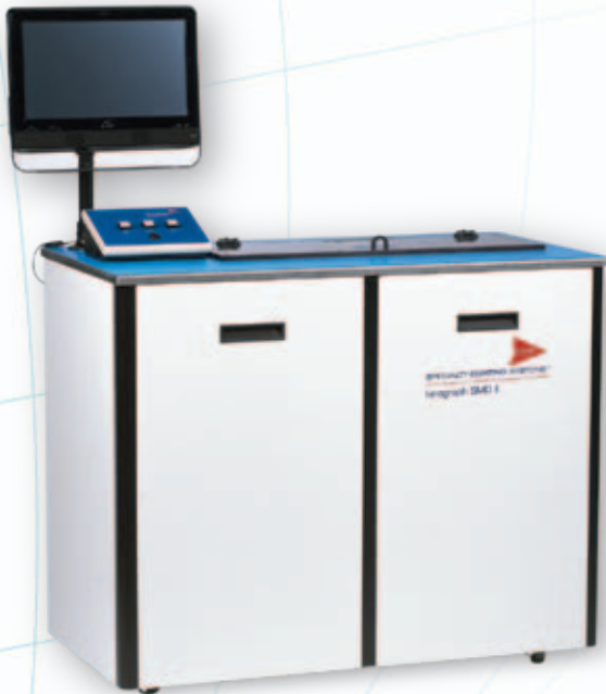
Ionograph® SMD II with onboard all-in-one computer