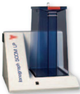
Ionograph® 500M LP