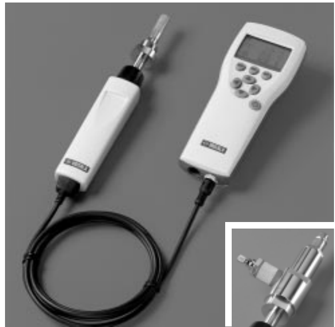
DM70 Hand-held Dewpoint Meter with optional Sample Cell Adapter

The DM70 is calibrated at the factory against internationally traceable standards, and delivered with a calibration certificate. It can also be sent to a Vaisala Service Center for a traceable re-calibration.