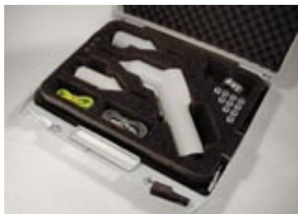
ESD3000 – EMC PARTNER's battery operated, portable, 30 kV ESD generator