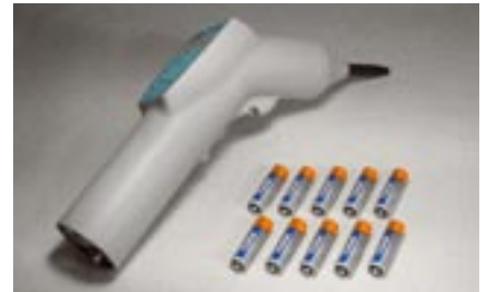
ESD3000 is powered by regular or rechargeable batteries.