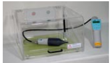
ESD3000 with remote DM for testing explosive devices