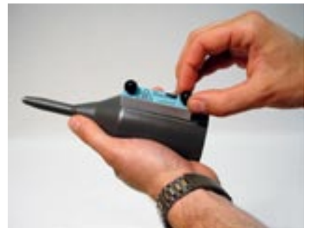
As standard equipment, risetime switching on 30kV modules