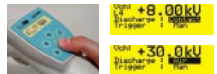
The ergonomic design allows easy parameter change during operation with one hand and without fatigue.