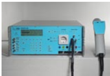
TRA2000 controller with ESD2000

As standard accessories ESD3000 is equipped with one set of UM-3/AA size NiMH rechargeable batteries a power adapter for recharging, 2 m Earth cable, serial link cable to update the software via EMC PARTNER's website, user manual with verification protocol, conformity declaration and software package. All delivered in a smart case.