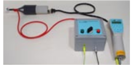
ESD3000 Safety Switch

500 Ohm target with SMA connector. Calibrated target attenuator cable chain according to IEC61340-3-1 and -2.