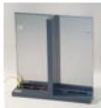
ESD-VCP50 – Vertical Coupling Plate