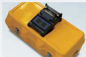
Place & Splice!