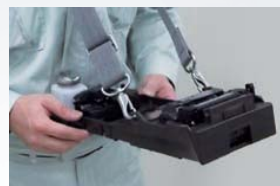
Sling & Splice!