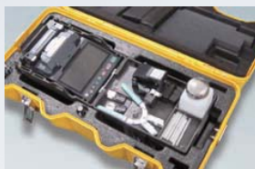
Open & Splice!