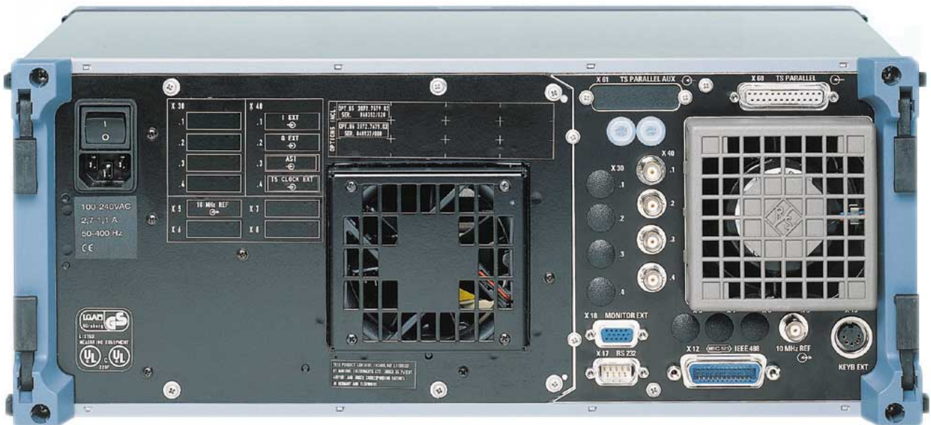
R&S SFQ rear view