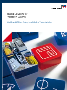
Testing Solutions for Protection Systems

For a complete list of available literature please visit our website.