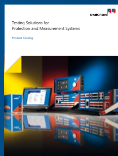
Product catalog (secondary equipment)

The following publications provide detailed information on the products described in this brochure and their applications: