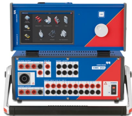
CMC 353 with CMControl-3 Front Panel Control (option)

Besides its operation with the powerful Test Universe software running on a PC, the CMC 353 can also manually be controlled with the highly flexible CMControl unit.