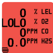
Red display in alarm conditions