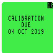
Configurable calibration options