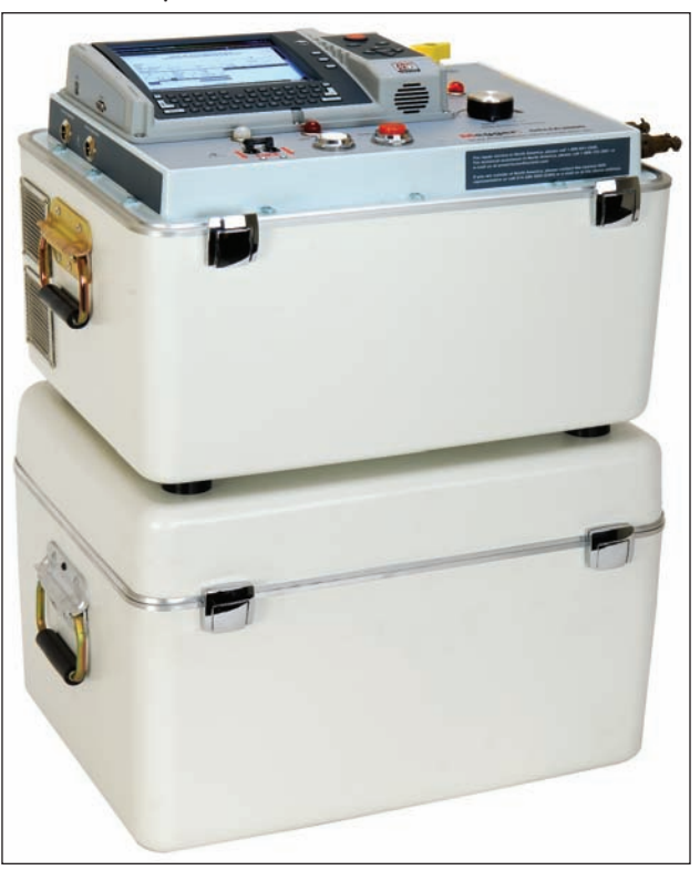
The DELTA3000, available in either 120 or 240 V ac/50 or 60 Hz, includes the Control Unit (top) and High Voltage Unit (bottom)