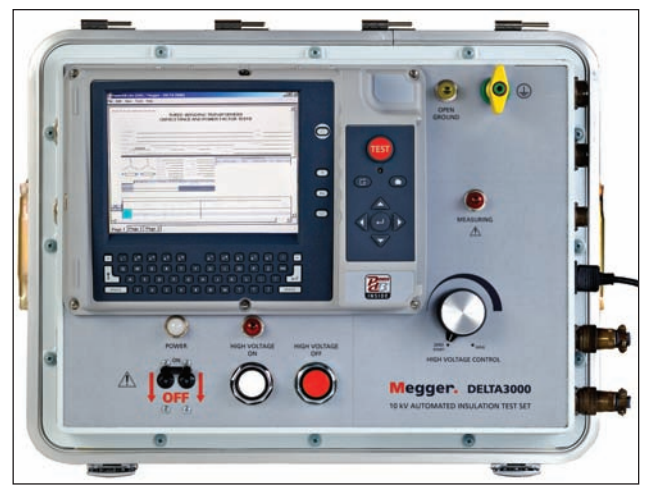
Close-up of DELTA3000 panel