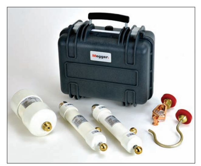
Optional capacitor kit includes carry case, TTR capacitor (left), and 2 reference capacitors (center). Also shown are 2 connectors (right) that will work with the capacitors and are supplied with the DELTA3000 unit