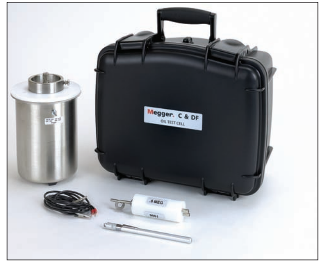
The optional Oil Test Cell, C/N 670511, is used for testing insulating fluids up to 10 \mbox{kV}