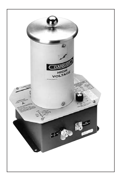
The optional Calibration Standard traceable to the NIST for quick operating or calibration checks of test set bridges calibrated in watts loss or in dissipation factor