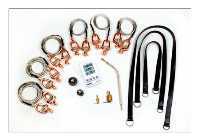
The optional accessory kit, C/N 670501 includes mini bushing tap connectors, hot collar straps, temperature/humidity meter, .75" bushing tap connector, 1" bushing tap connector, "J" probe bushing tap connector, 3-ft non-insulating shorting leads, 6-ft non-insulating shorting leads