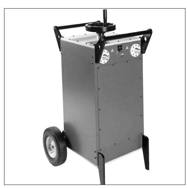
The optional Resonating Inductor expands the capacitance range of the DELTA3000