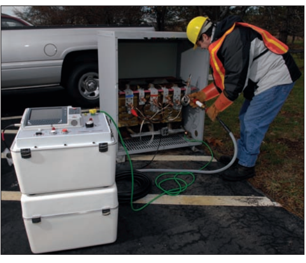
DELTA3000 shown testing a pad mount transformer

quantities include voltage, current, power (loss), power factor and capacitance. The operator has the option of correcting the current and loss readings to their 2.5 kV or 10 kV equivalents. Information can be downloaded directly to a PC or USB flash device, allowing the user to store up to 100,000 data sets. Printing is done via a second USB port directly to a USB thermal paper printer (included) allowing the user to print full-size test forms in either 8.5" x 11" or A4 size, without the use of an external laptop.