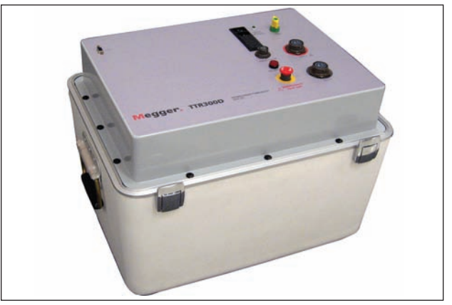
Optional TTR300D module, for LV three-phase TTR testing, installed inside DELTA HV cabinet. (Lid not shown for clarity.) PowerDB ONBOARD controls the TTR300D module, providing all the benefits as referenced in the Megger TTR330 product specifications.