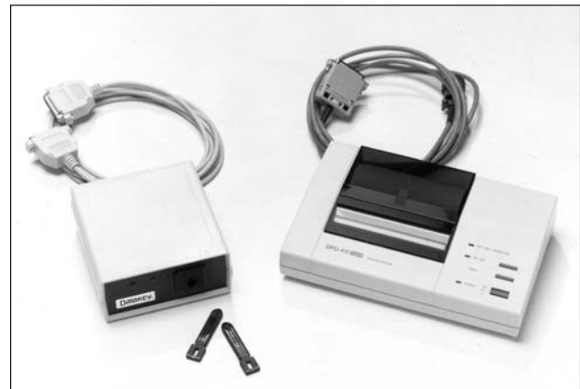
Data Keys with PC interface box and standard thermal printer

Control Unit: 74 lb (33kg) High Voltage unit: 63 lb (29 kg) Cables: 35 lb (16 kg)