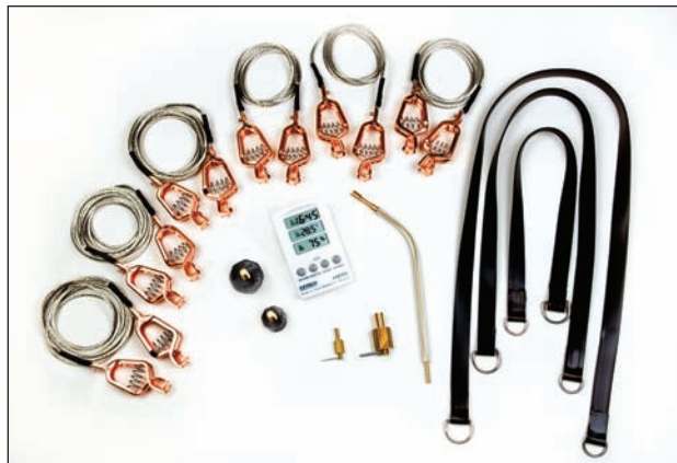
The optional accessory kit, C/N 670501 includes mini bushing tap connectors, hot collar straps, temperature/humidity meter, .75" bushing tap connector, 1" bushing tap connector, "J" probe bushing tap connector, 3-ft non-insulating shunting leads, 6-ft non-insulating shunting leads