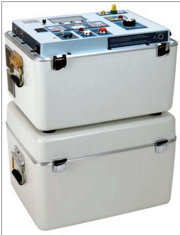
The DELTA2000, available in either 120 or 240 V ac/50 or 60 Hz, includes the Control Unit (top) and High Voltage Unit (bottom)