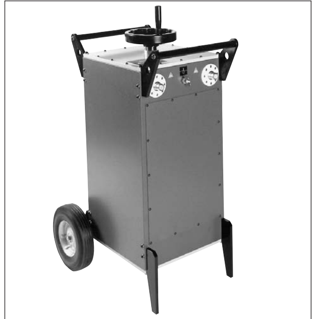
The optional Resonating Inductor expands the capacitance range of the DELTA2000