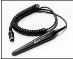
Optional bar code wand for recording an alphanumeric test identification