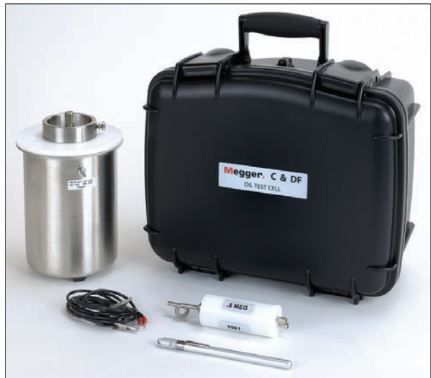
The optional Oil Test Cell, C/N 670511, is used for testing insulating fluids up to 10 kV