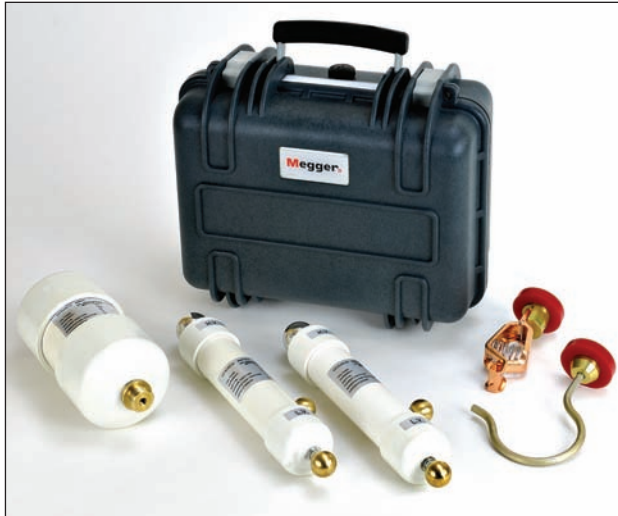
Optional capacitor kit includes carry case, TTR capacitor (left), and 2 reference capacitors (center). Also shown are 2 connectors (right) that will work with the capacitors and are supplied with the DELTA2000 unit