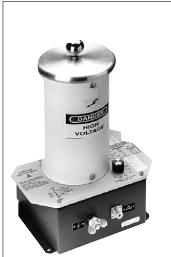
The optional Calibration Standard traceable to the NIST for quick operating or calibration checks of test set bridges calibrated in watts loss or in dissipation factor