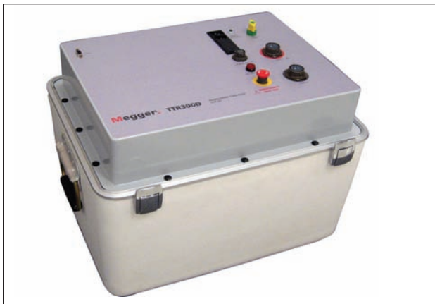
Optional TTR300D module, for LV three-phase TTR testing, installed inside DELTA HV cabinet. (Lid not shown for clarity.) Via PowerDB software, TTR testing is in accordance with Megger TTR300 product specifications. External laptop is easily placed on top surface of module for added convenience.