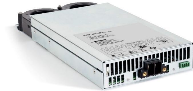
Figure 6c The N6753A – N6756A High performance and the N6763A – N6766A Precision DC power modules each occupy two module slots within the mainframe. All other modules occupy 1 module slot.

For details on these products and how they can be used for applications including battery drain analysis and function test, visit www.keysight.com/find/N6780 and download the N6780 Series Source/Measure Units (SMUs) for the N6700 Modular Power System Data Sheet , literature number 5990-5829EN