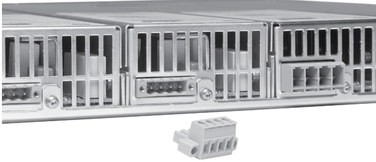
Figure 5. Quick disconnects for power and sense leads