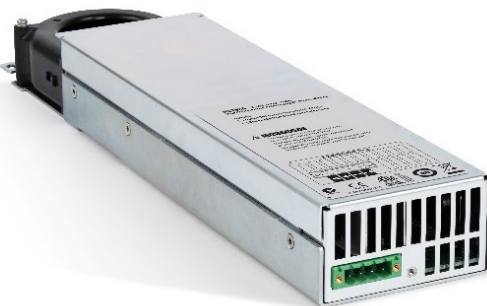
Figure 6b. The basic series

The Keysight N6730, N6740 and N6770 Series of DC power modules provide programmable voltage and current, measurement and protection features at a very economical price, making these modules suitable to power the DUT or to provide power for ATE system resources, such as fixture control.