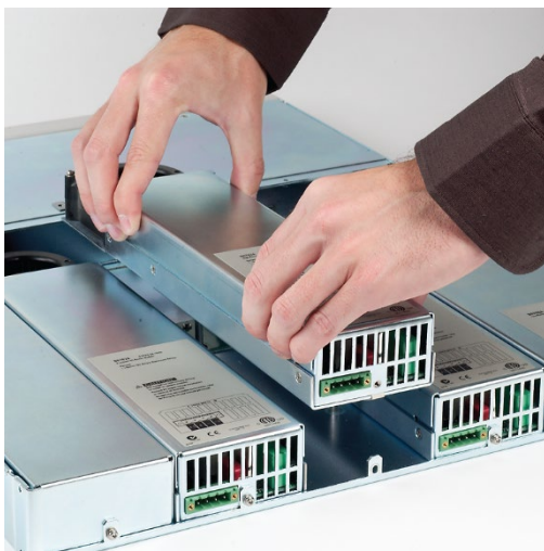
Figure 6c. User re-configurable modular system

For details on these products and how they can be used for specific applications visit www.keysight.com/find/N6783A-BAT , www.keysight.com/find/N6783A-MFG and download the N6783A-BAT Data Sheet , 5990-8662EN and the N6783A-MFG Data Sheet , 5990-8643EN.