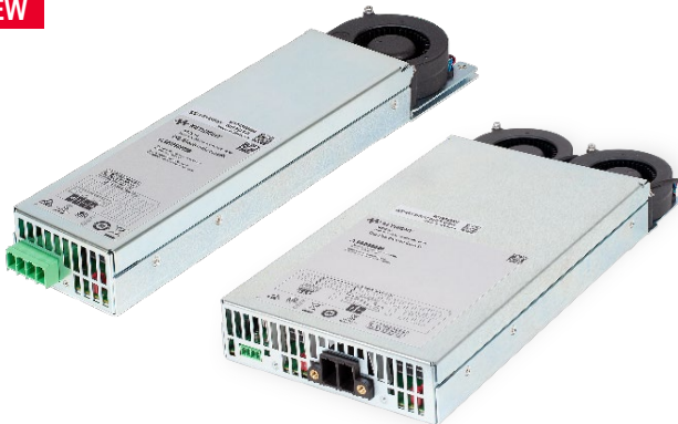
Figure 6a. The Electronic Load Series