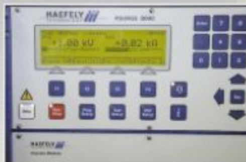
PREPARED TO MEET THE FUTURE