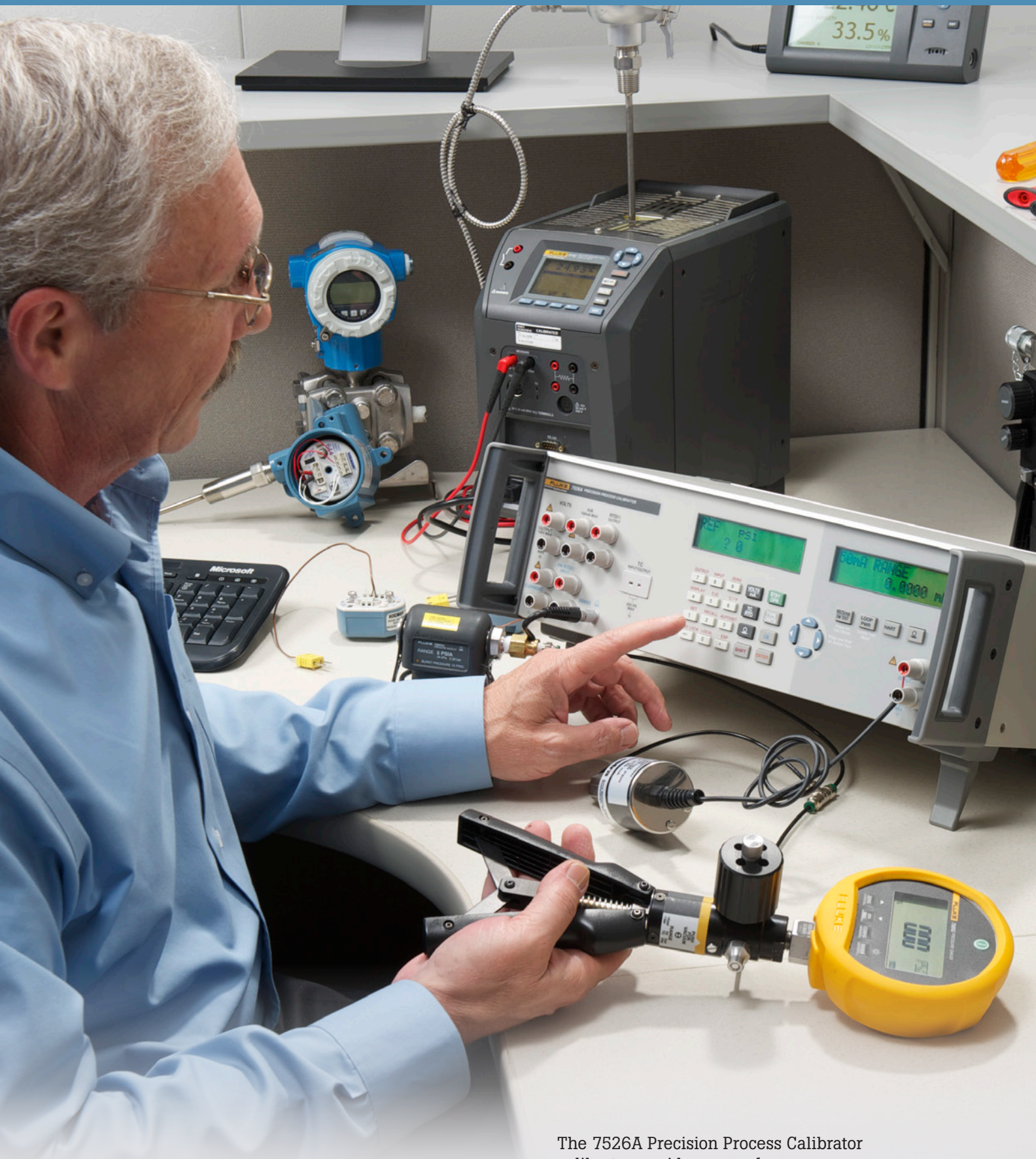
The 7526A Precision Process Calibrator calibrates a wide range of pressure gauges, temperature transmitters, digital process simulators, multimeters and more.