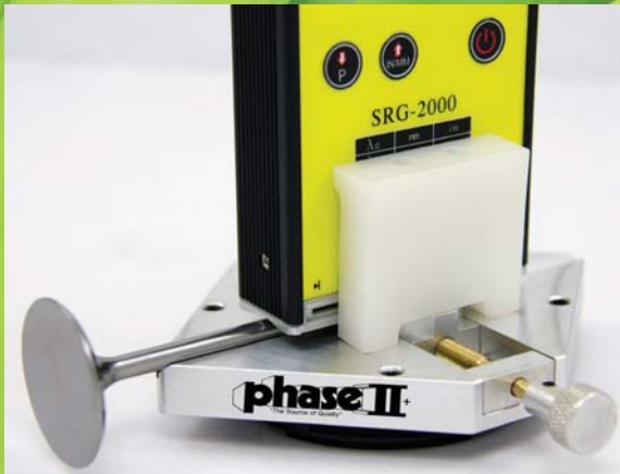
Shown w/optional small parts vise

The SRG-2000 determines surface roughness parameters Ra, Rz, Rms(Rq) and Rt within a wide measuring range. The piezo-electric pick-up stylus with diamond tip assures a very reliable measurement within tolerances that conform to ASME B46.1. Surface Roughness parameter Ra is computed to conform to ISO and Rz is computed to conform to DIN.