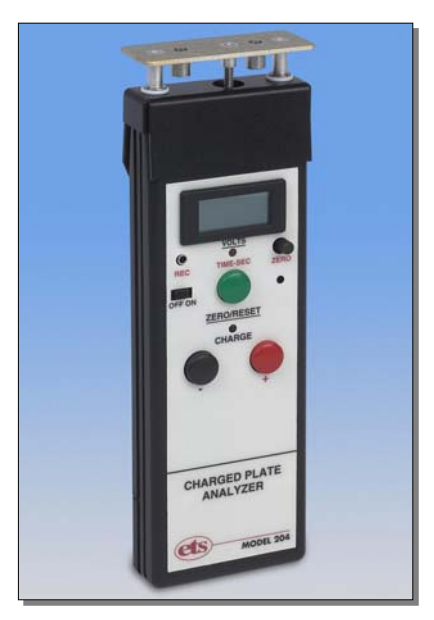
Figure 2-1: Model 204 Charged Plate Analyzer

The Model 204 operates from a single 9V alkaline battery with a typical operating life of approximately 20 hours. Low battery is indicated by all decimal points illuminated on the DPM.