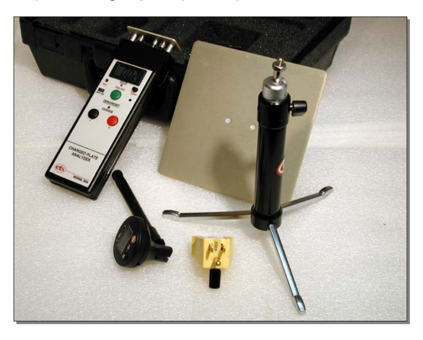
Figure 2-2: Model 216 Charged Plate Monitor Kit

This section describes the other functional components included in the Model 216 Kit shown in Figure 2-2. The included tripod is used to hold the Model 204 in either a vertical or horizontal position to facilitate ionizer (horizontal) and charged plate (vertical) measurements.