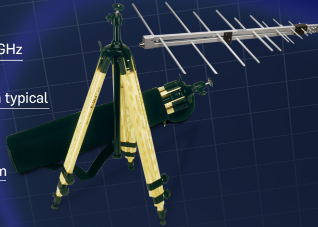
LP-04 and tripod