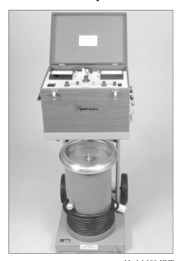
Model 100 HVT AC Hipot Tester