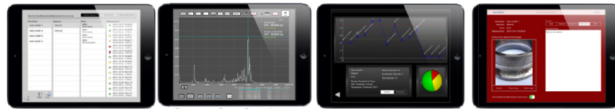
View Plant Status