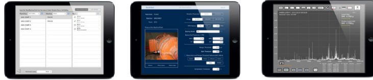
Create, Edit and Manage Routes