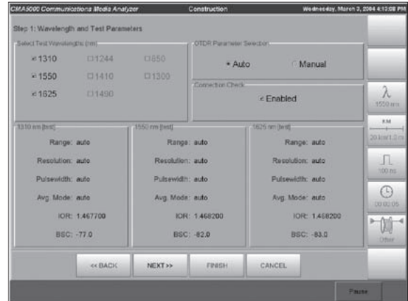
Construction OTDR – automated multi-fiber testing

Cable commissioning is also automated through the use of Construction OTDR mode where a wizard allows the user to select the required testing wavelengths, number of fibers and file naming scheme. The wizard then becomes the project manager guiding the user through the testing and ensuring consistency with testing parameters and file naming – virtually eliminating user induced errors.