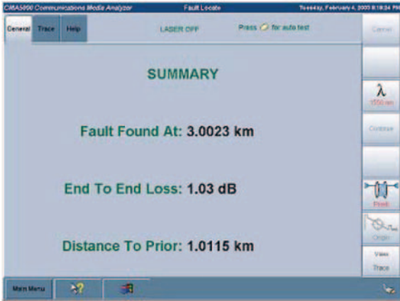
Fault Locate Mode – ease to read results

Fault Locate mode is designed for someone just starting out or the novice who only uses an OTDR occasionally. Simply connect the fiber and press test. The unit will verify the fiber is connected correctly, select testing parameters, execute the test and provide a text response indicating fault/break location and end to end loss.