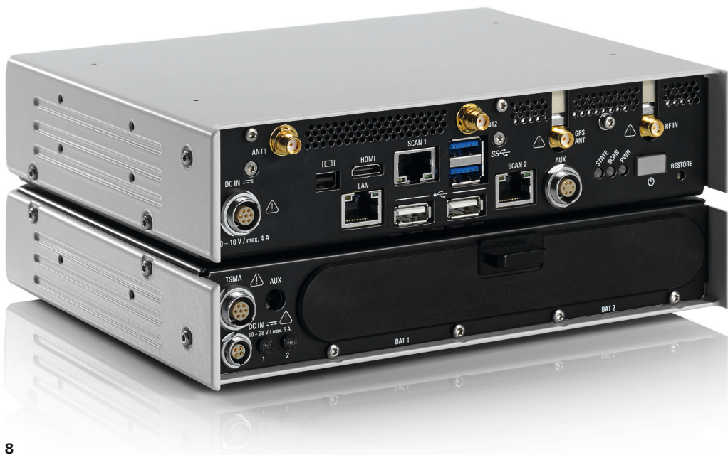
R&S®TSMA with R&S®TSMA-BP battery pack.

The optional R&S®TSMA-ZCB carrying bag simplifies mobile scanner operation. The bag has room for the R&S®TSMA with battery pack, two spare batteries, a mobile phone and the R&S®TSME-Z7 antenna (frequency range: 700 MHz to 2.6 GHz). The battery pack is easily accessible, for fast replacement of batteries during operation. For a MIMO 2x2 measurement setup with the R&S®TSMA and one additional R&S®TSME connected, the optional R&S®TSMA-ZCB2 carrying bag helps operating the setup during walktesting.