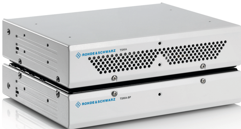
R&S®TSMA with R&S®TSMA-BP battery pack.