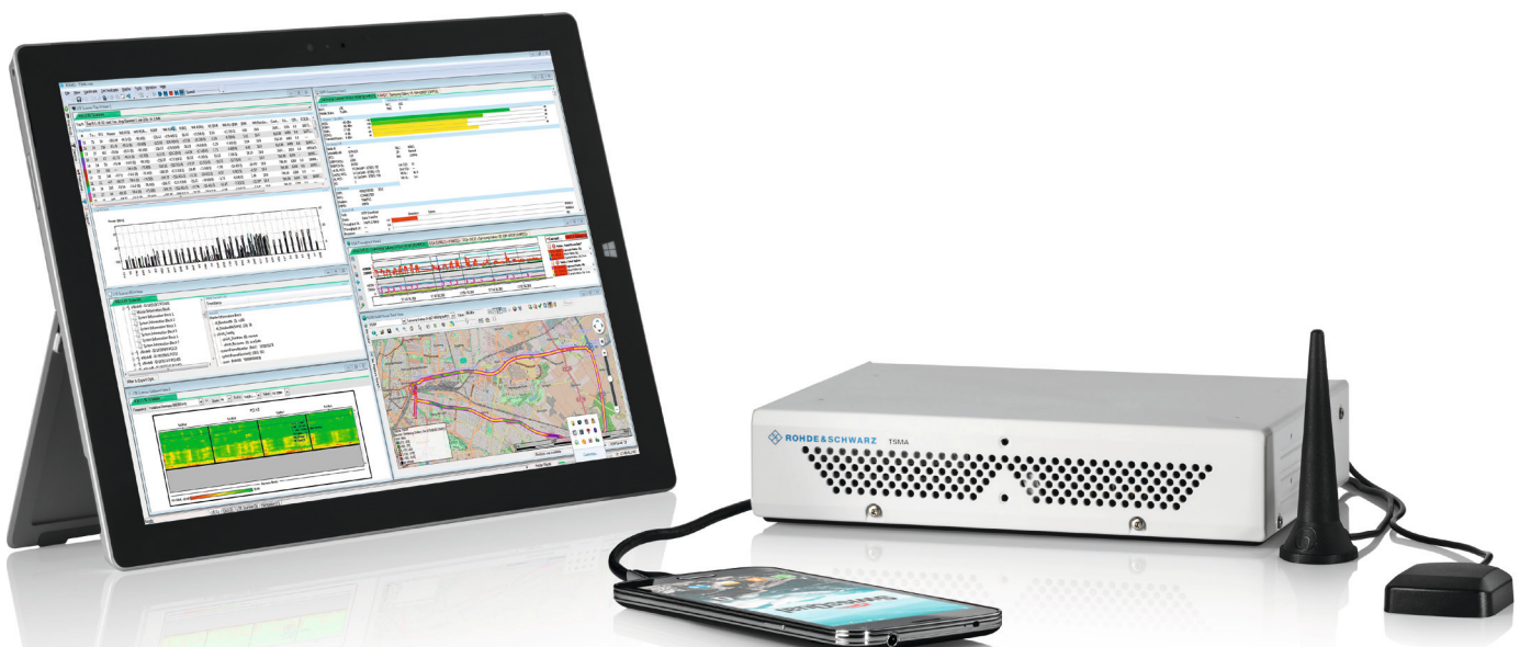
R&S®TSMA running R&S®ROMES for tests with scanner and test phone.