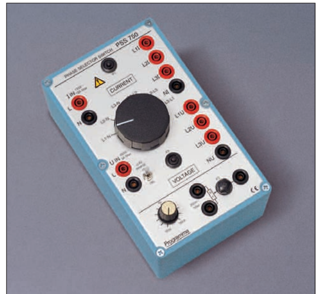
Phase Selector Switch (PSS750)