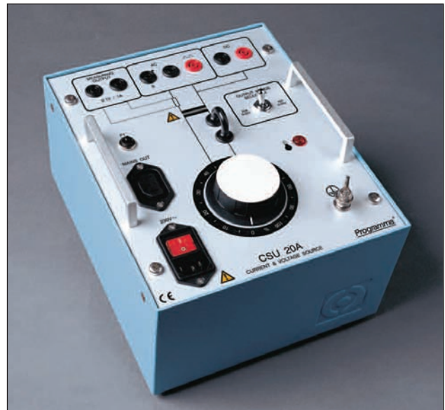
Current and Voltage Source (CSU20A)

Measurement method AC, true RMS DC, mean value Range 0.00 – 600.0 V Accuracy 1 AC, ±(1% + 200 mV) Max. value DC, ±(0.5% + 200 mV) Max. value. Values are range depending