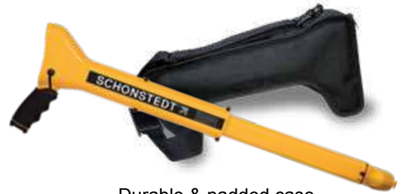
Durable & padded case with shoulder sling