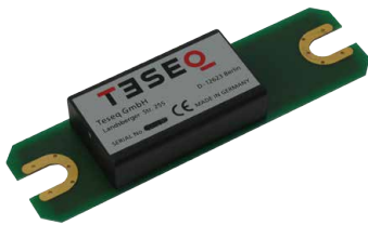
EXT 10uF, option external 10 µF capacitor for RTCA/DO-160G