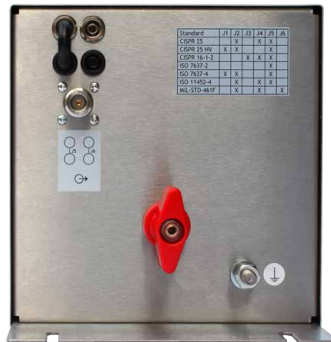
HV-AN 150, view to the EUT port