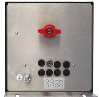
HV-AN 150, view to the AE port

AMETEK CTS Europe GmbH Landsberger Str. 255 · 12623 Berlin · Germany T +49 30 56 59 88 35 F +49 30 56 59 88 34 info.rf.cts@ametek.com www.teseq.com