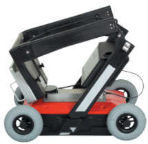
The MALÅ Easy Locator HDR's hinged shaft simplifies logistics between sites and minimizes startup time

The MALÅ Easy Locator HDR is an all-in-one unit with a hinged shaft enabling the entire unit to fit in the back of a standard station wagon for transportation between sites. The (HDR) high dynamic range antenna, optimized for utility detection , are ruggedized, sealed and shielded. The Easy Locator monitor has excellent readability, even in direct sunlight, and the keyboard-less interface is controlled by a single turn-and-push dial. All sensitive parts of the system are carefully protected in a robust aluminum casing, weather protected and built to last through harsh environments and rough transports. The MALÅ Easy Locator is built to deliver at site and the dedicated built-in software is tailored for utility detection and include all necessary components from start to finish. MALÅ's goal when designing and building the system was to make ground penetrating radar simpler, cost effective and more accessible to the utility market, hence the name, The MALÅ Easy Locator HDR .