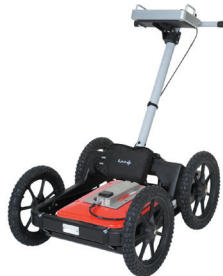
The MALÅ Easy Locator HDR fits also nicely into the MALÅ Rough Terrain Cart (RTC) option.

For more information, see www.malags.com