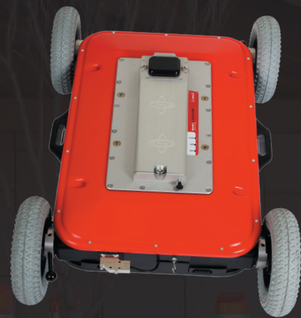
MALÅ EasyLocator HDR Antenna and Controller