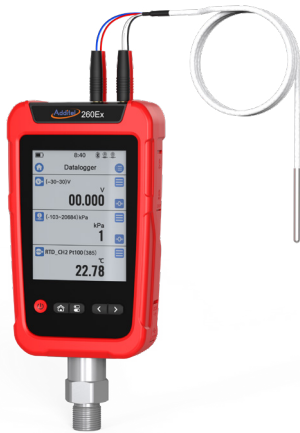
ADT260Ex with AM1602 temperature probe

Note: The ADT260Ex can be purchased without the ADT158Ex module if needed using the following part number: ADT260EX-NO