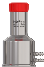
"ADT161Ex pressure modules - See ADT161 Datasheet for more info"

Note: [1] For custom RTD cable lengths over 100 feet (30 meters), which will adhere to Class B, please contact Additel.