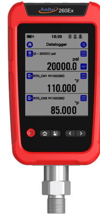
Additel 260EX with ADT158Ex module