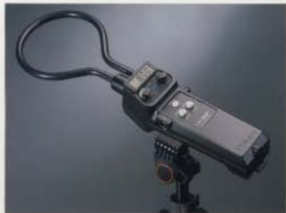
MiniZap with Model MZT-12 H-Field Simulation Tip.

For this reason, the KeyTek Model MZT-12 H-field simulating tip is driven by the MiniZap's contact mode simulation circuits, NOT by a slow, air-gap discharge as in some other ESD simulators.