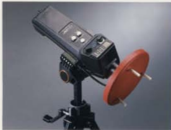
MiniZap with Model MZT-11 E-Field Simulation Tip.

Interchangeable Discharge Tips for both Contact Mode and Air Discharge: permitting user-selection of tests to the updated IEC standard, or tests to the latest ANSI draft standard more closely representing the real-world ESD threat.