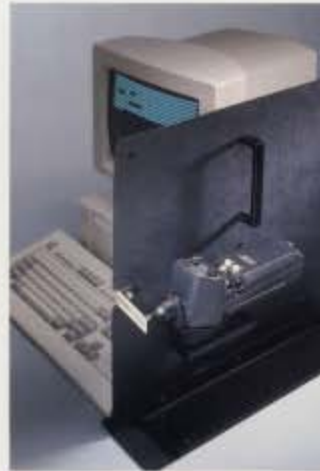
Vertical Coupling Plane Model VCP-1, being used to test a PC. The MiniZap is positioned to inject current via IEC Contact-Mode Omni-Tip™ Model TPC-2A into the center of a VCP vertical edge, per the requirements of the various standards.

Contact mode testing is used to insure repeatable, fast-risetime, ESD current waveforms into the edge of the VCP.