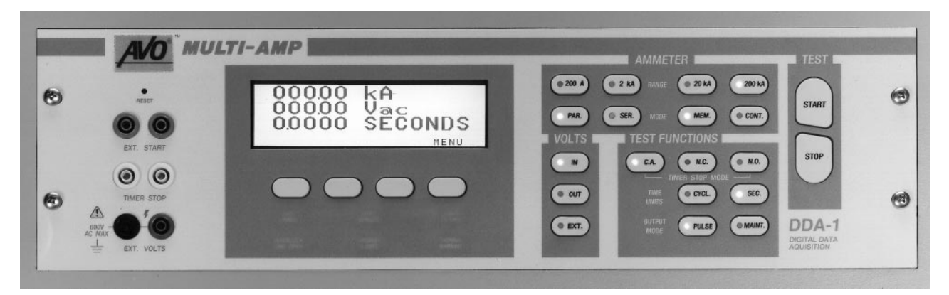
The Model DDA-1 control panel digitally samples the output current and mathematically calculates the current supplied to the breaker under test.

The digital control of the SCRs also allows the unit to initiate at any point within 90 degrees of the zero crossover point of the output-current waveform. This will allow the intentional insertion of a dc offset into the waveform for a complete investigation of a breaker's operation.