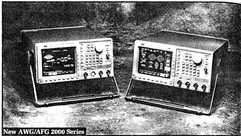
New AWG/AFG 2000 Series