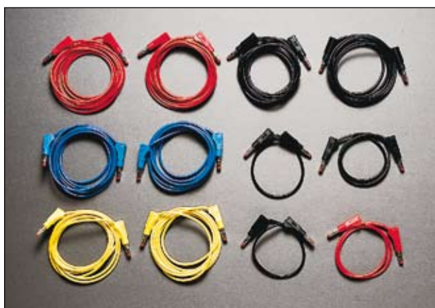
Test lead set GA-00032.