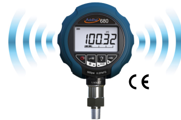
680 with data logging and wireless (optional)