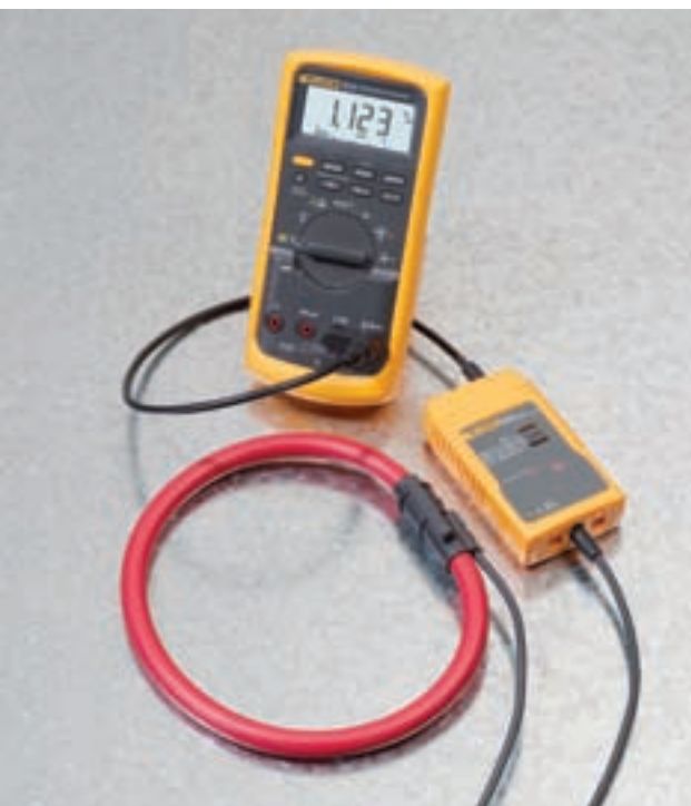
i2000 Flex connected to a Fluke 87V Digital Multimeter.

Fluke. Keeping your world up and running.™