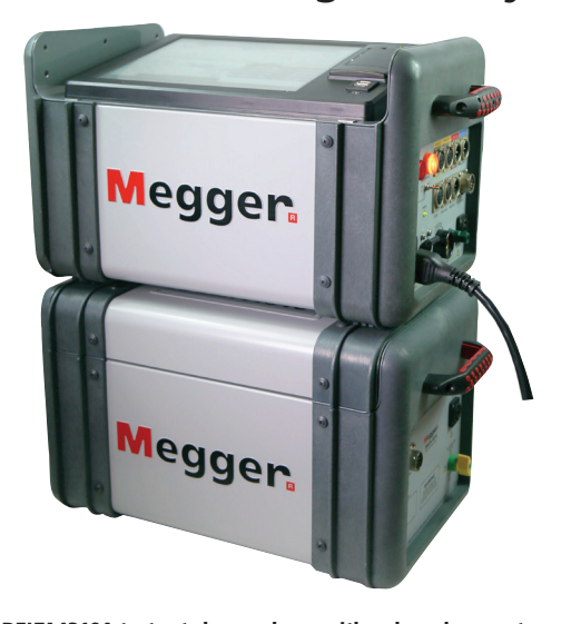
DELTA4310A test set shown above with onboard computer