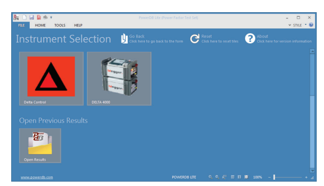
DELTA4310A OnBoard computer screen