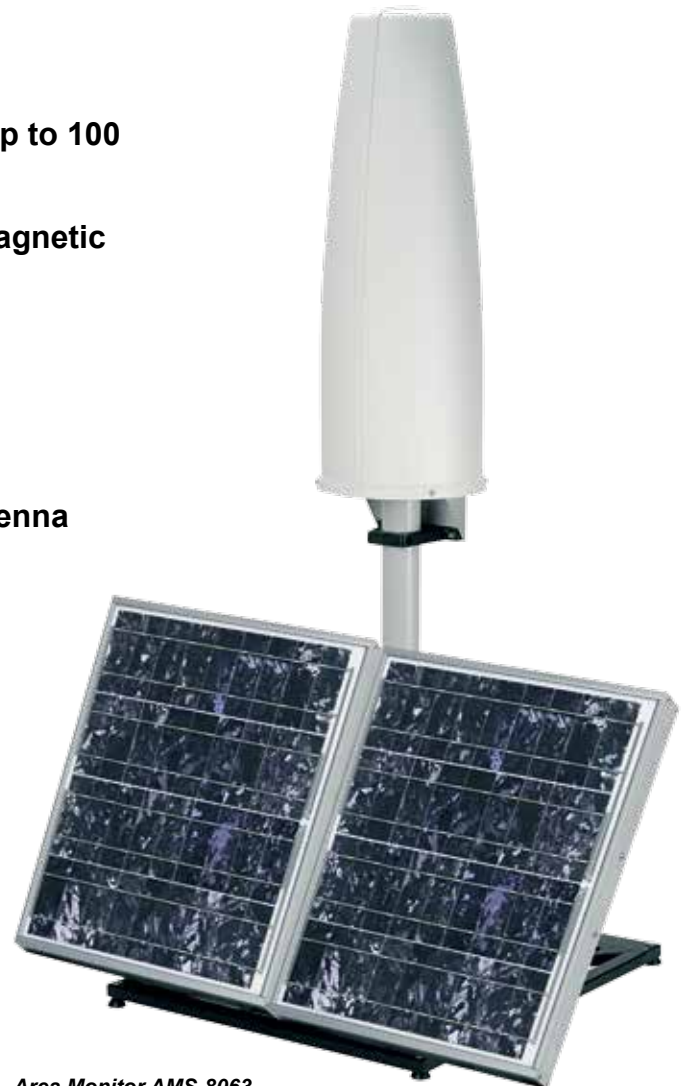
Area Monitor AMS-8063 with Solar Panel