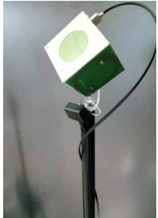
The electromagnetic field analyzer

The power supply is provided by a Ni-Mh battery, installed internally to the cubic housing.