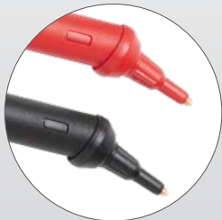
Intelligent test probe with integrated LCD display