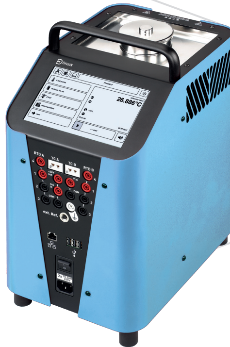
PTC165i Integrated measuring instrument