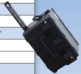
Optional Transport Case