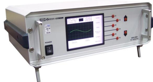
DDX Series Partial Discharge Detectors