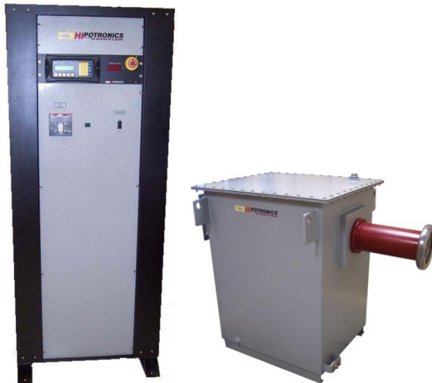
Standard System Controller

Hipotronics AC Dielectric Test Sets are available in a wide range of voltage and power ratings with exceptional reliability, durability and functionality. No matter what your requirement, Hipotronics has an affordably priced, highly reliable test solution to meet your needs.