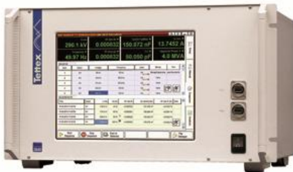
2820a & 2840 C / tanδ bridges