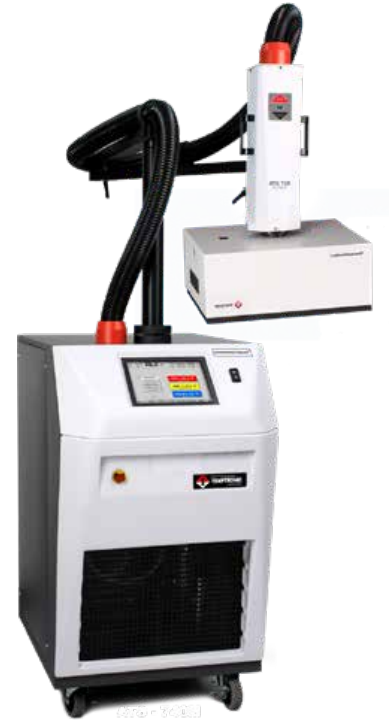
MOBILETEMP™ system configured with Hood style THERMOCHAMBER™ and a THERMOSTREAM® temperature source

THERMOCHAMBERS™ are available in a variety of styles and sizes and they can be used interchangeably with THERMOSTREAM® temperature sources to provide a modular and flexible range of MOBILETEMP™ systems.