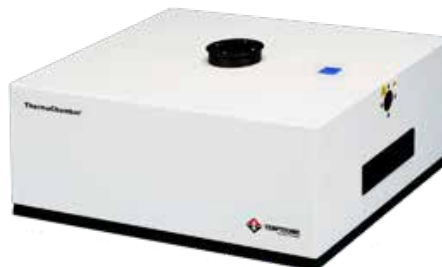
The Hood's top connector port enables easy connection to the THERMOSTREAM® air source.