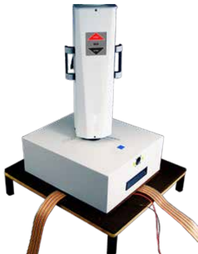
Shown with optional BASE. The Hood style THERMOCHAMBER™ is lowered over the test subject, enclosing it and creating a moisture free thermal test environment.