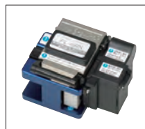
Table-top cleaver FC-6 / FC-6R series