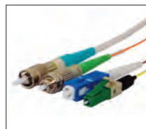
Compatible with Lynx-CustomFit™ Splice-on Connector