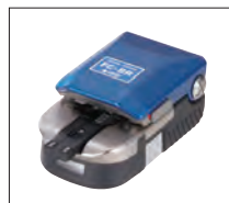
Handy cleaver FC-8R series