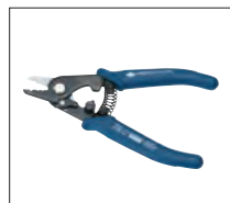
Jacket remover JR-M03