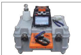
Carrying case with worktable CC-72