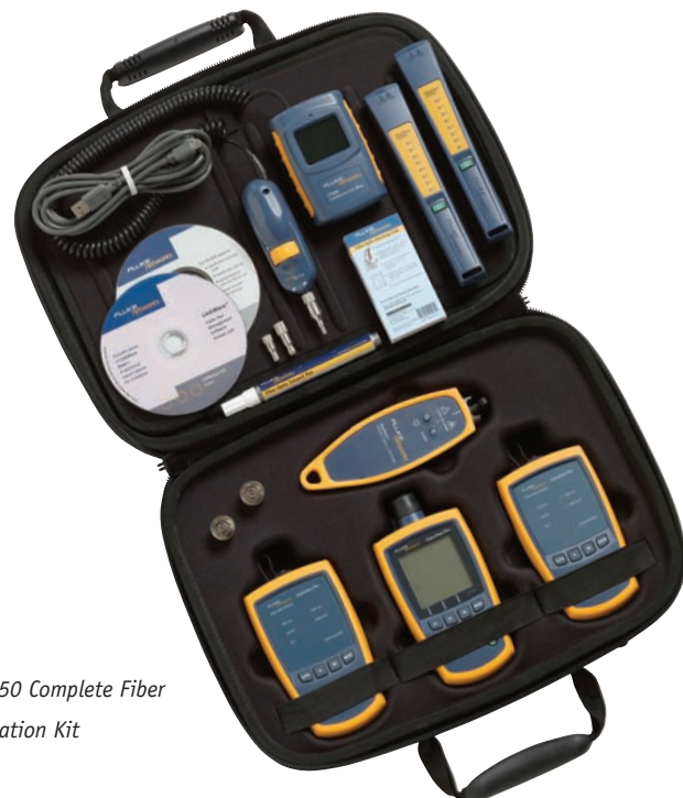
FKT1450 Complete Fiber Verification Kit