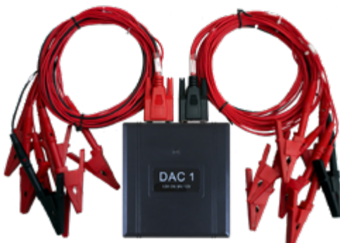
Data Acquisition Case (DAC)

Eagle Eye's SLB-Series Load Banks come with an optional DAC package allowing the voltage of EACH CELL to be wirelessly monitored and recorded during discharge. The DAC package allows the user to evaluate the health of each cell and replace only the cells that require replacement - saving time and money by significantly reducing labor hours and replacement costs.