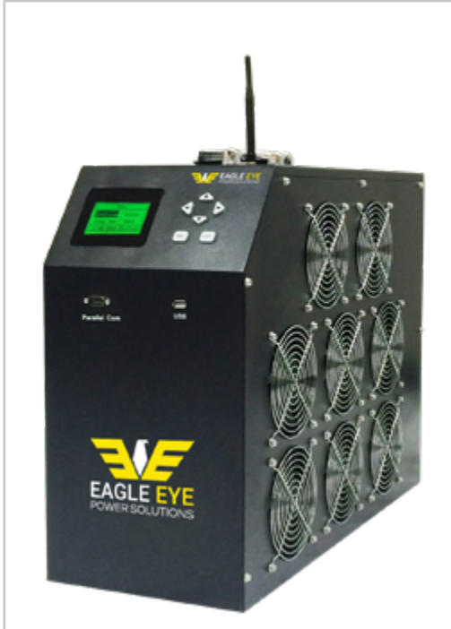
SLB-Series DC Load Bank