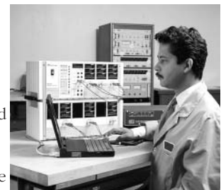
PULSAR performs computerized tests with IBM, or compatible PCs, even notebooks.

For high-current applications, PULSAR can be connected to the Multi-Amp EPOCH-20, and EPOCH-II, High-Current Output Units. The Multi-Amp High-Current Interface Module provides the control interface between PULSAR and the EPOCH-20 or EPOCH-II to provide high-current, high-volt/ampere output for single-, three- or six-phase testing. For specifications on the Interface Module, the EPOCH-20 and EPOCH-II, refer to catalog entries for these models.