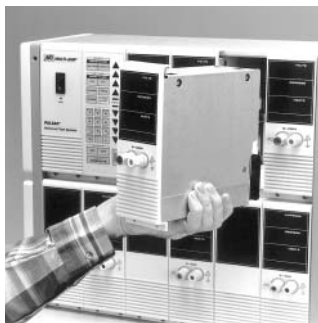
Modules slide out easily so you can configure the system to meet your applications.

The system is customized by adding a timer module and the number of current and voltage amplifier modules needed for specific testing applications.