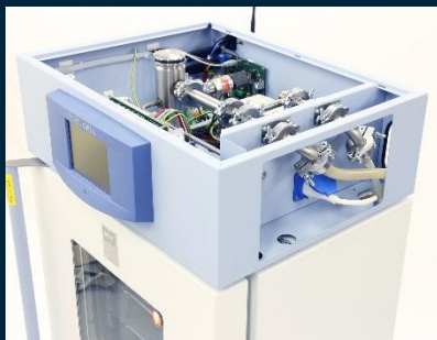
Vacuum & Power Connections