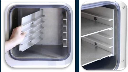
Chamber Shelves & Brackets