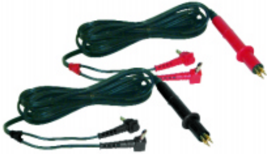
Kelvin probes, 10A, set of two Catalog #1017.82