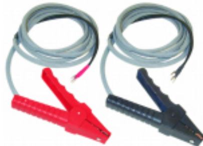
Kelvin clips, 10A set of two Catalog #1017.84

Test Equipment Depot 99 Washington Street Melrose, MA 02176-6024