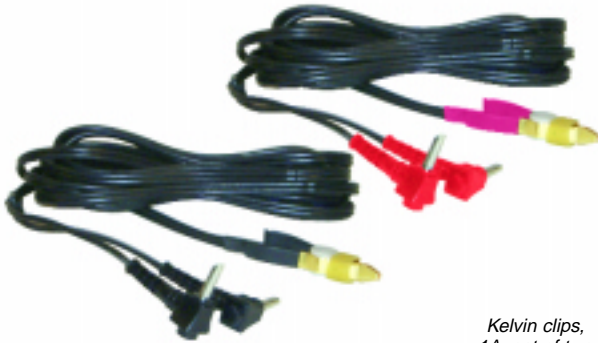
Kelvin clips, 1A, set of two Catalog #1017.83