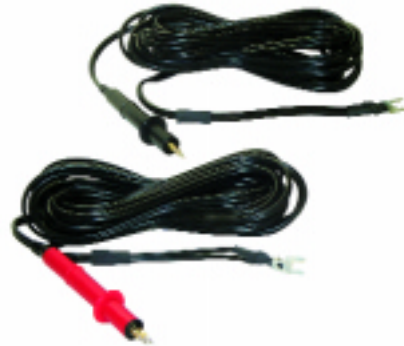
Kelvin probes, 10A, 20 ft spring loaded Catalog #2118.52