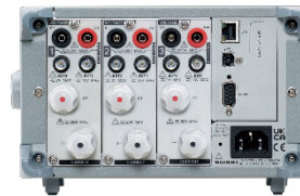
GPM-8330 Rear Panel