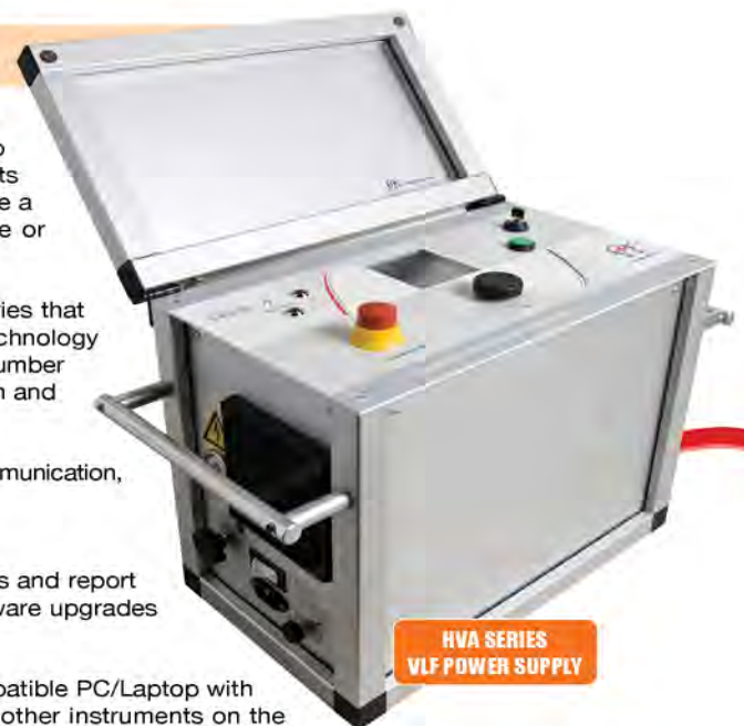
HVA SERIES VLF POWER SUPPLY

With some test instruments on the market, you spend more time generating a test report than you do performing the actual physical test. At the click of a mouse, the Tan Delta Control Center generates a report within seconds of completing a test in either a summarized single page or detailed multiple page format. Each TD test can be saved electronically in PDF, CSV or XML Excel™ file format. TD Test reports can then easily be stored, emailed, printed or additional analyzed.